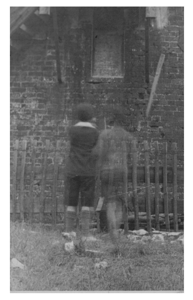
The boy and shadowy figure to the right